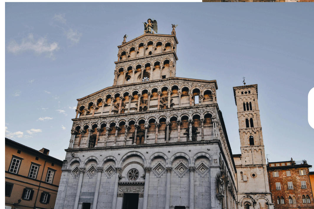
The walled city of Lucca